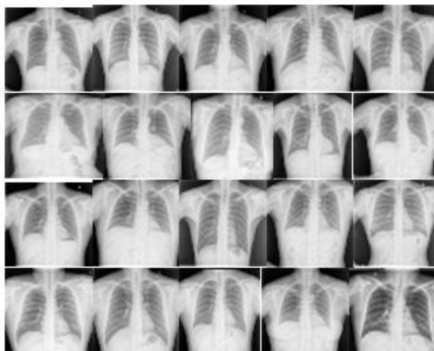
Fig 2. Sample Negative Tuberculosis (TB)

The sample of tuberculosis (TB) images used in the study consisted of 622 TB images, with 326 negative TB images and 296 positive TB images. Tuberculosis (TB) image samples used as training data amounted to 60% of the 622 images and 40% were used as testing data. The data used in this study are images with a size of 256x256. Image files used for training and testing are taken from http://openi.nlm.nih.gov/imgs/collections/ChinaSet_AllFiles .zip . Examples of some image samples used in this study can be seen in Figure 2 and Figure 3 below.