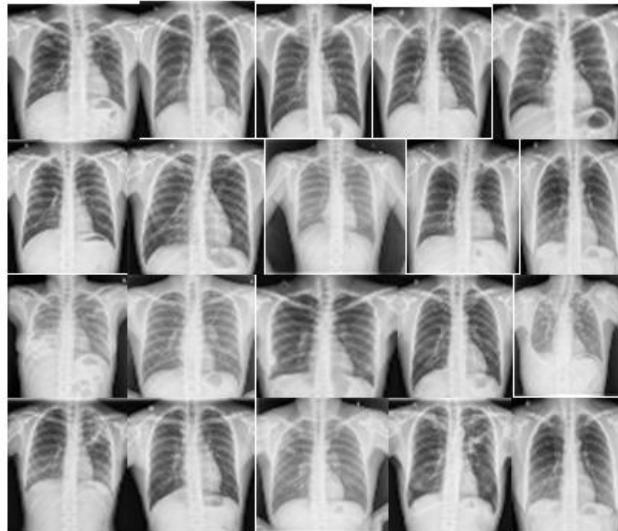
Fig 3. Sample Positve Tuberculosis (TB)