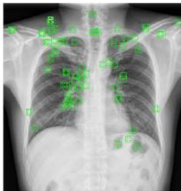
Fig 4. Example of HOG Extraction

In Figure 4. below, you can see an example of the feature extraction results from HOG: